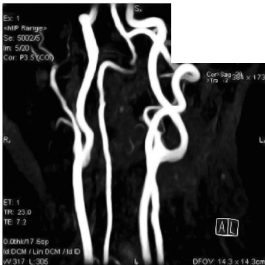
Figure 4. Divergent position of the right internal carotid artery (medially) and the right external carotid artery