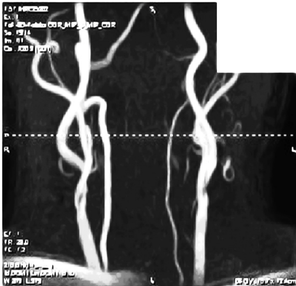
Figure 5. Double cross of the internal carotid artery and external carotid artery