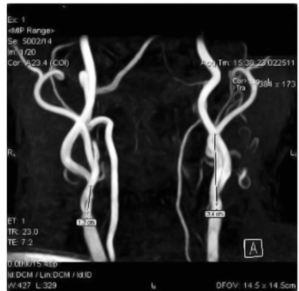
Figure 6. Crossing of the internal carotid artery and external carotid artery (height of crossing 1.3 cm)