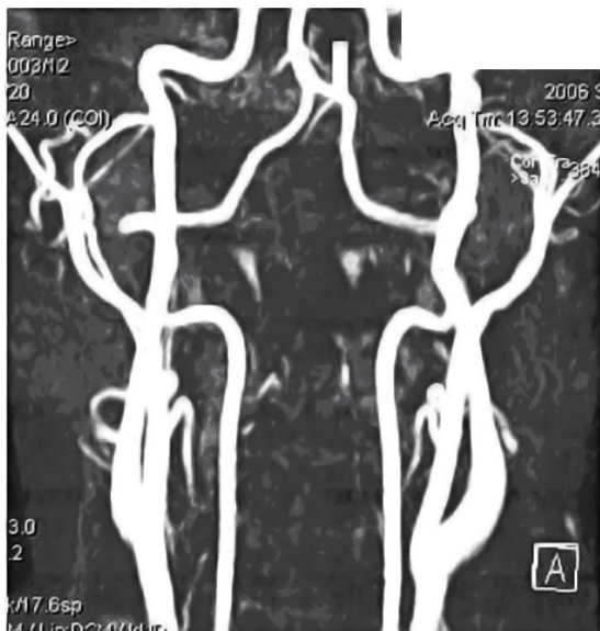
Figure 1. External carotid artery is placed medially from the internal carotid artery and crosses it in frontal side.