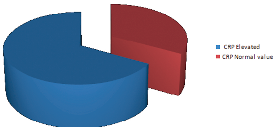
Figure 1. The value of CRP observed in patients with rheumatic diseases